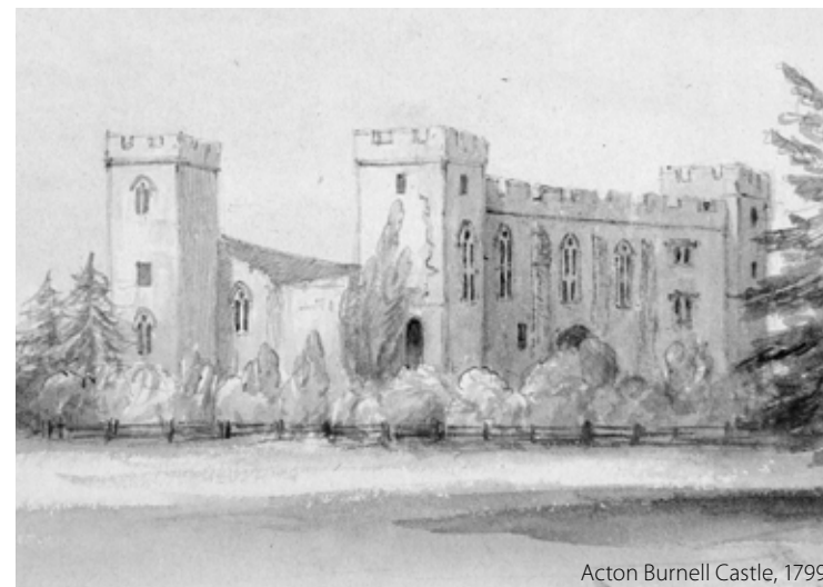
Acton Burnell Castle, 1799

Friends of Shropshire Archives and Shropshire Archaeological and Historical Society